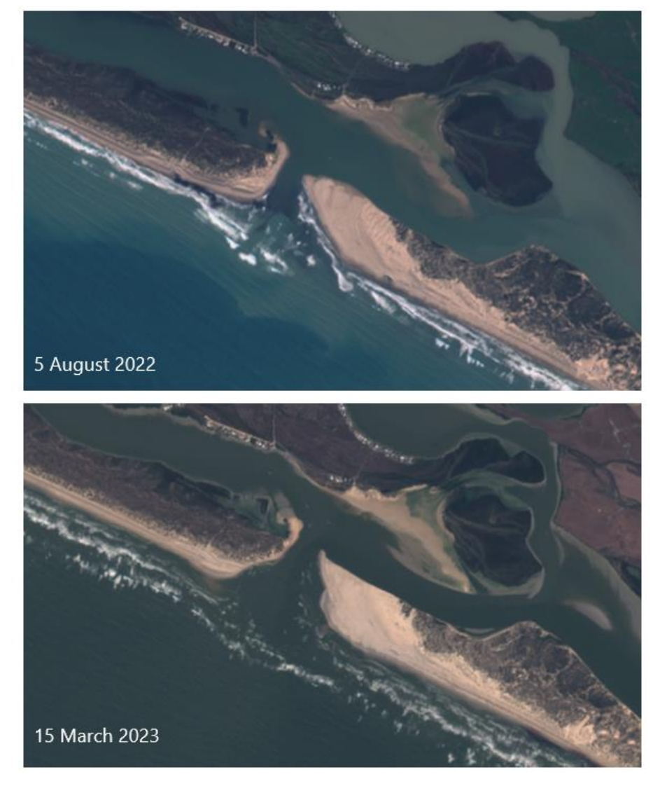
Figure 1: Satellite images of the Murray Mouth before and after flooding (Sentinel-hub Playground <a href="https://apps.sentinel-hub.com/sentinel-playground">https://apps.sentinel-hub.com/sentinel-playground</a>)

Aside from the visible widening of the mouth, the greatest scouring occurred to the depth of the channel between Young Husband and Sir Richard Peninsulas. A survey taken in early August 2022 showed that the depth of this area was around