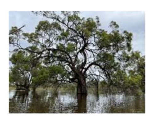
Figure 2: Black box growth following recent flooding on the Katarapko Floodplain (DEW)